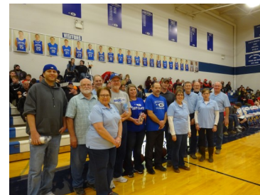
Musical chair participants and GCF Board members 02-01-2019

The GCF will again sponsor a Musical Chair Challenge on February 13, 2020 during half-time of the GHS/ Canton-Galva home basketball game.