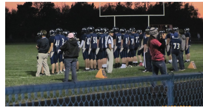
Community Wide Support

To ensure that any potential gift qualifies for a favorable charitable tax deduction, please contact us.